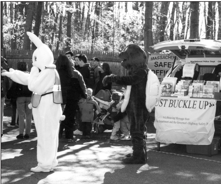
Buckle Bunny and Traffic Turtle attracted many to the car seat and seat belt safety displays.