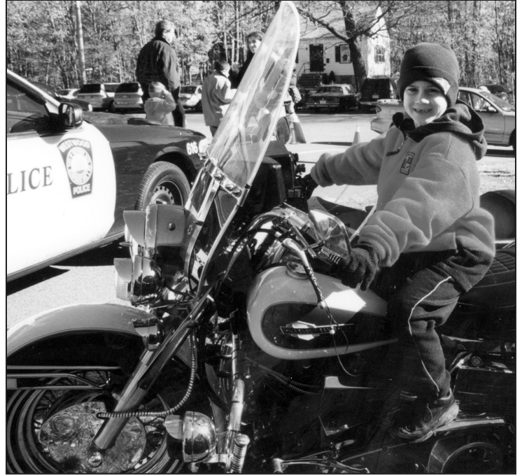
This retired police motorcycle is owned by a Norwood resident who brought it for youngsters to try.