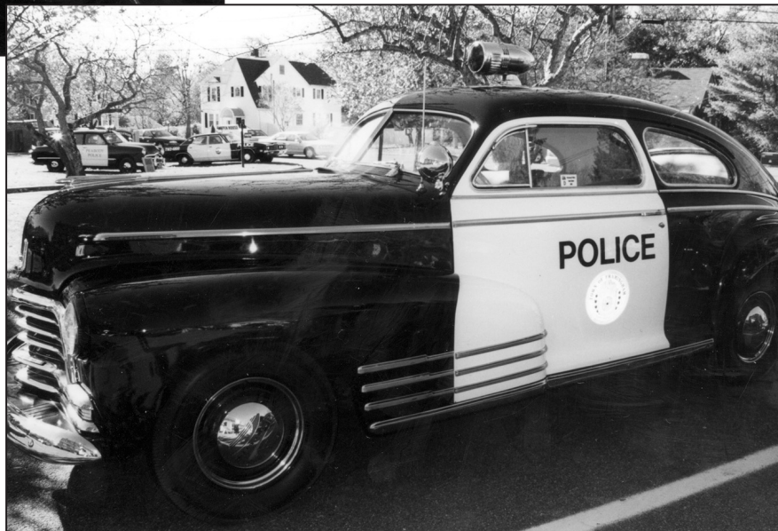
This 1946 Chevrolet, formerly owned by the Framingham Police, was one of 19 antique police cars on display.