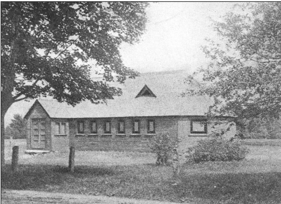
Islington Congregational Church. Westwood, ca. 1890s