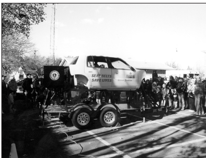
A crowd gathers to watch the Rollover Simulator, which demonstrates the value of seat belt use.