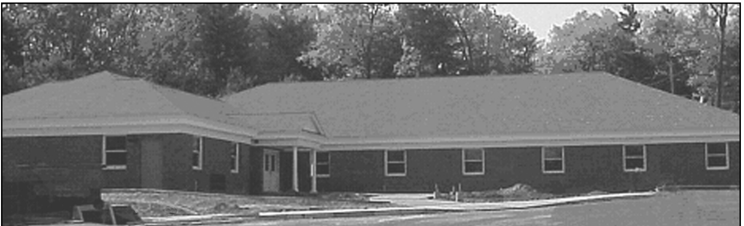
Municipal Office Building