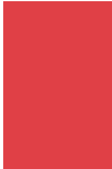
C20 METAL ANODIZED ALUMINUM PRE FINISHED - LIGHT CHAMPAGNE PEARL