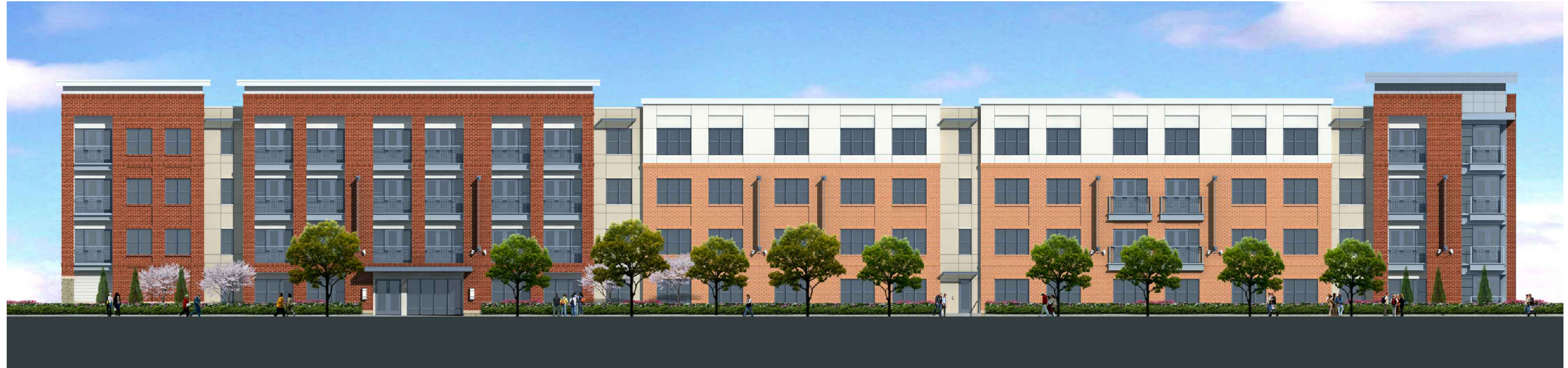
2 SOUTH ELEVATION SCALE: 3/32" = 1'-0"