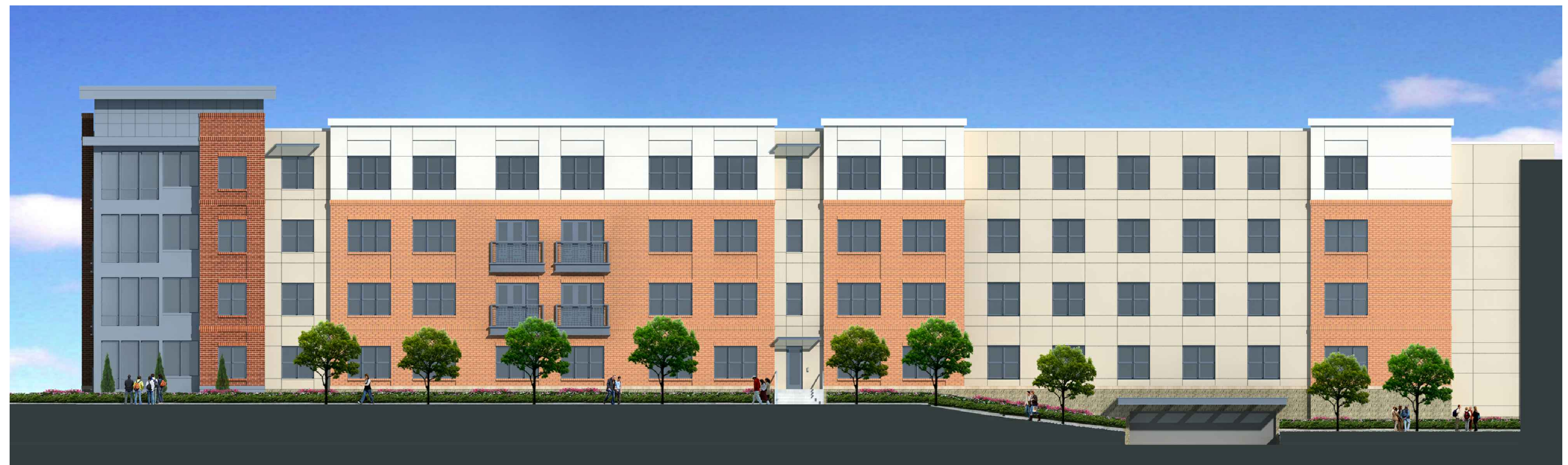
1 EAST ELEVATION SCALE: 3/32" = 1'-0"