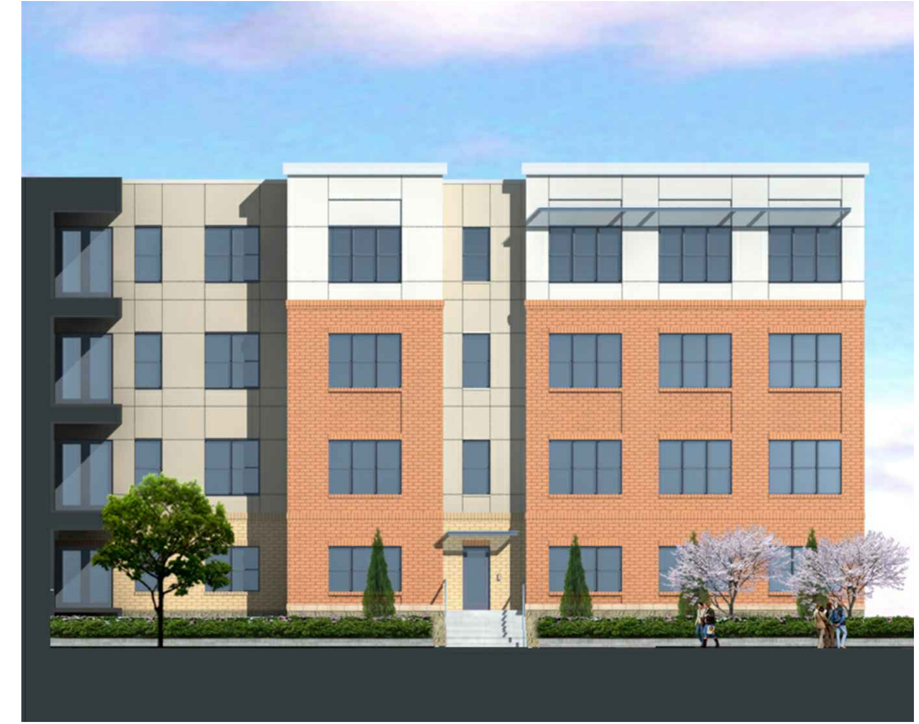
2 EAST CY ELEVATION SCALE: 3/32"=1'-0"