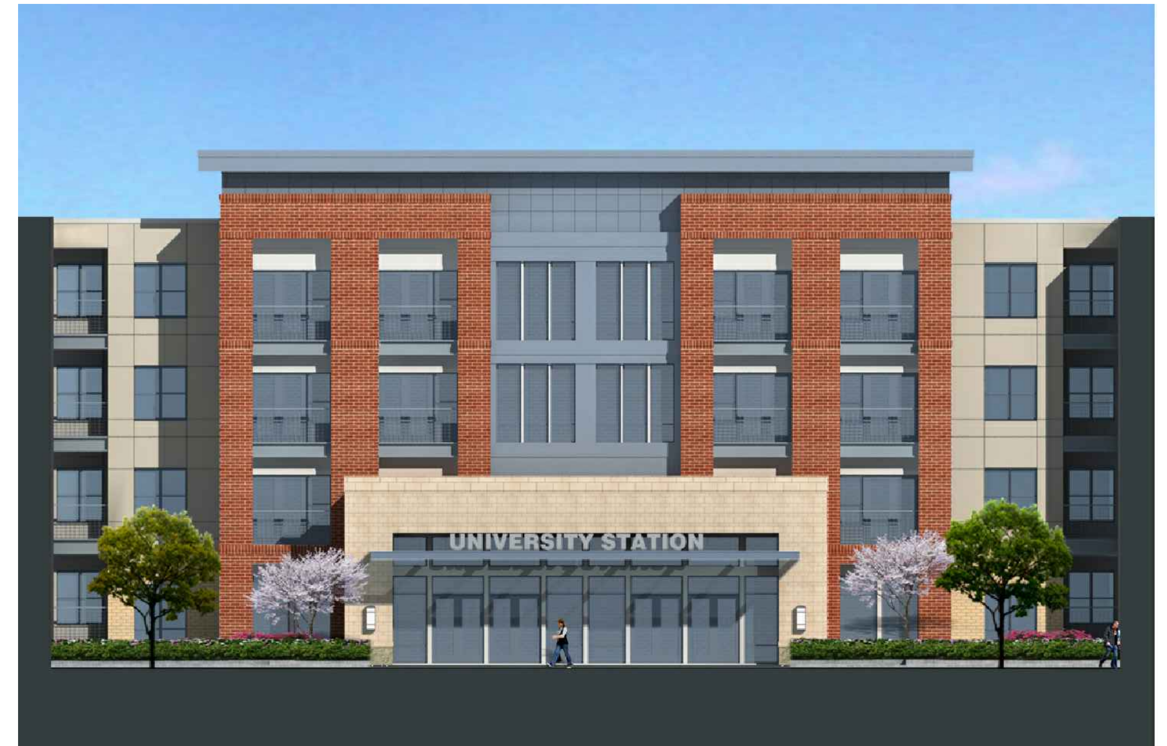
1 NORTH ELEVATION SCALE: 3/32"=1'-0"