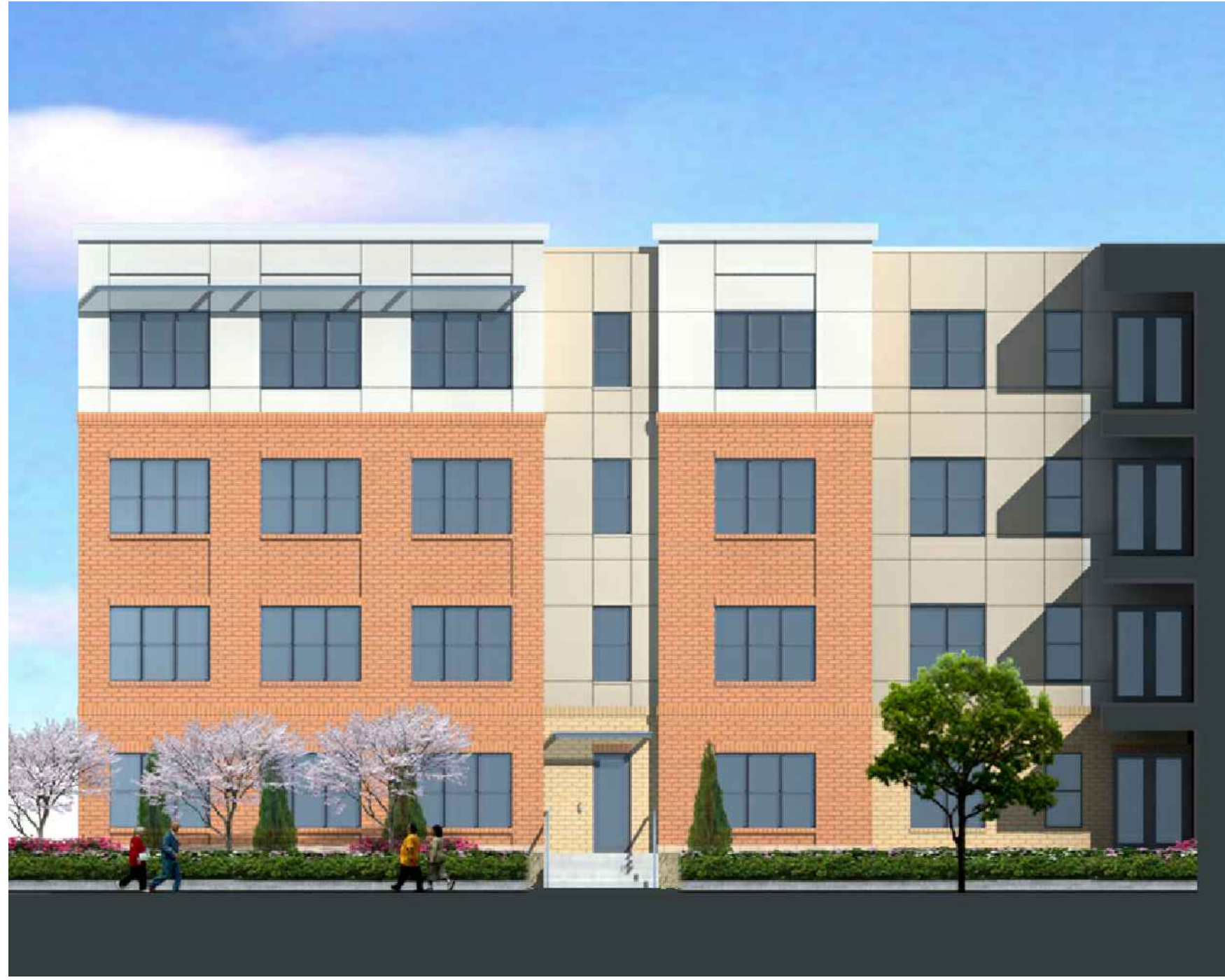
3 WEST CY ELEVATION SCALE: 3/32"=1'-0"