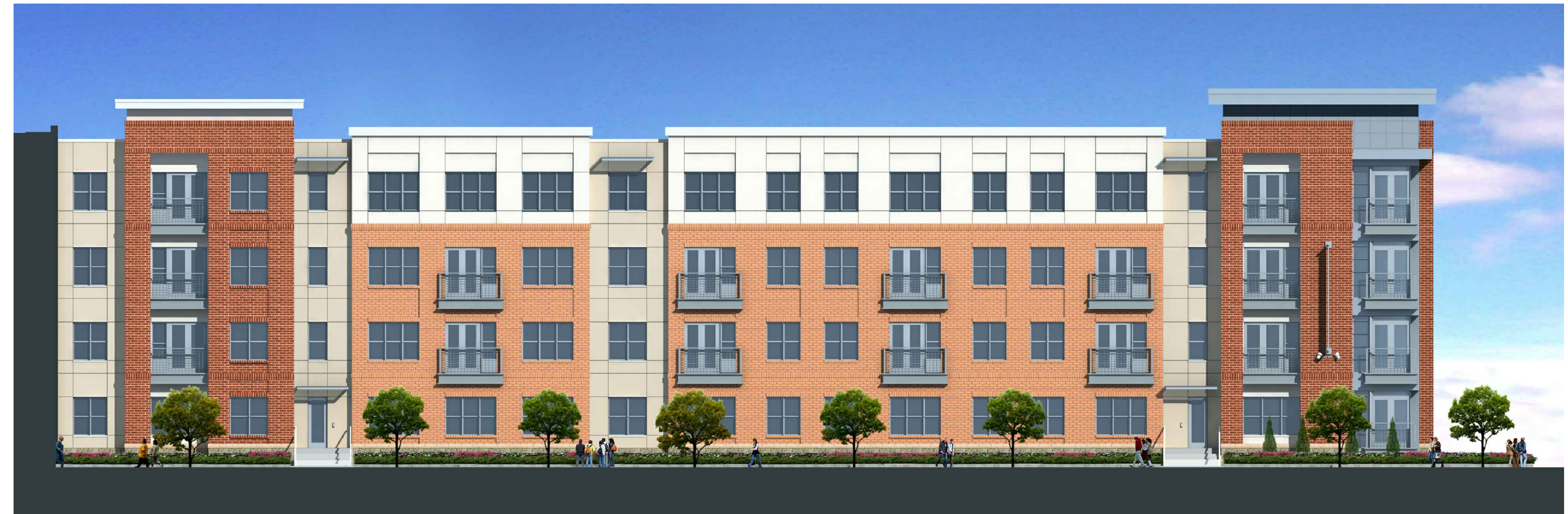
1 SOUTH ELEVATION SCALE: 3/32" = 1'-0"