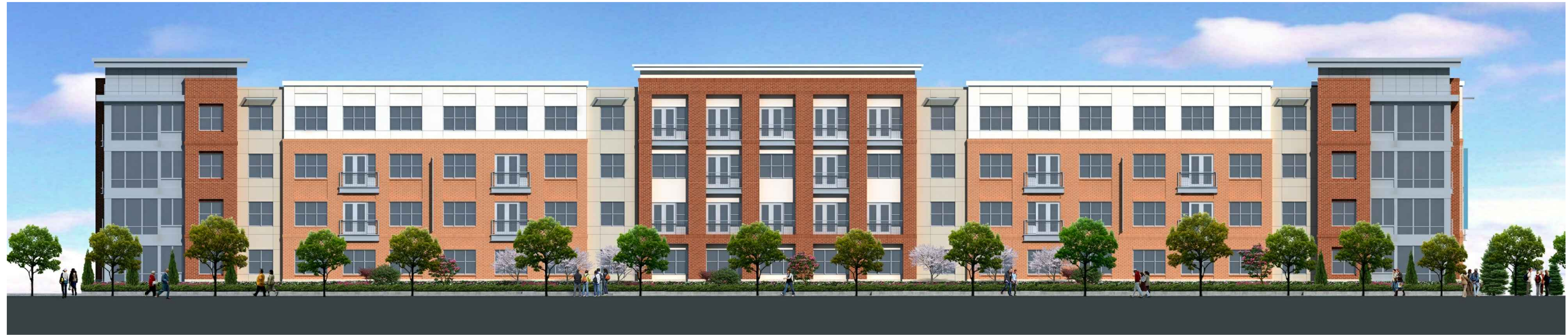
2 EAST ELEVATION SCALE: 3/32" = 1'-0"