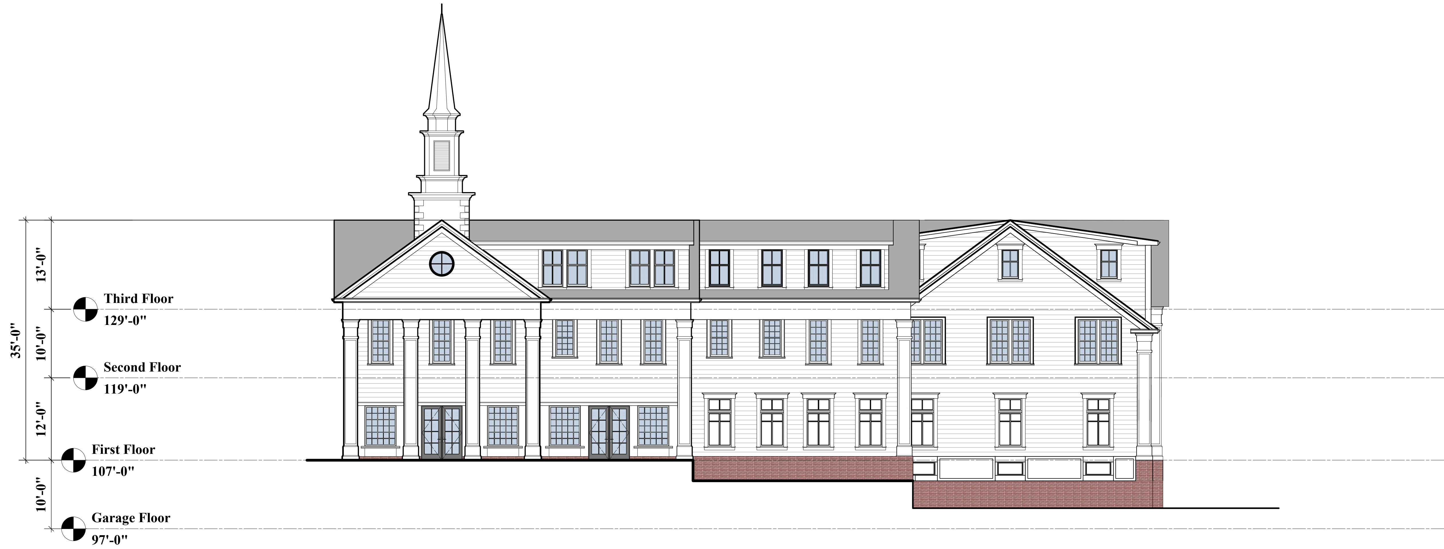
1 East Street Elevation 1/8" = 1'-0"