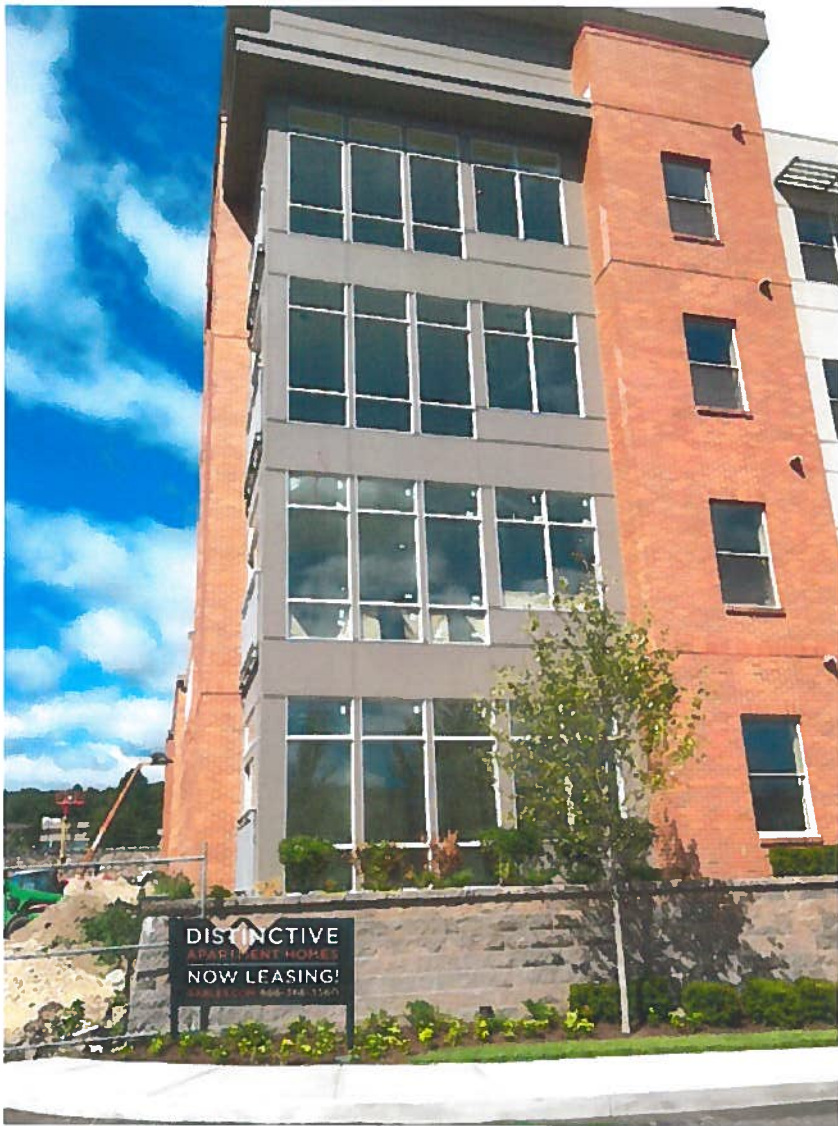
Above: rendering of proposed signage