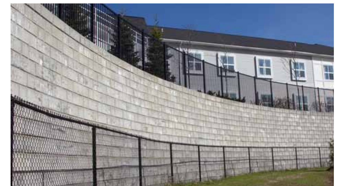
Retaining Wall Facade Options: Concrete Cast