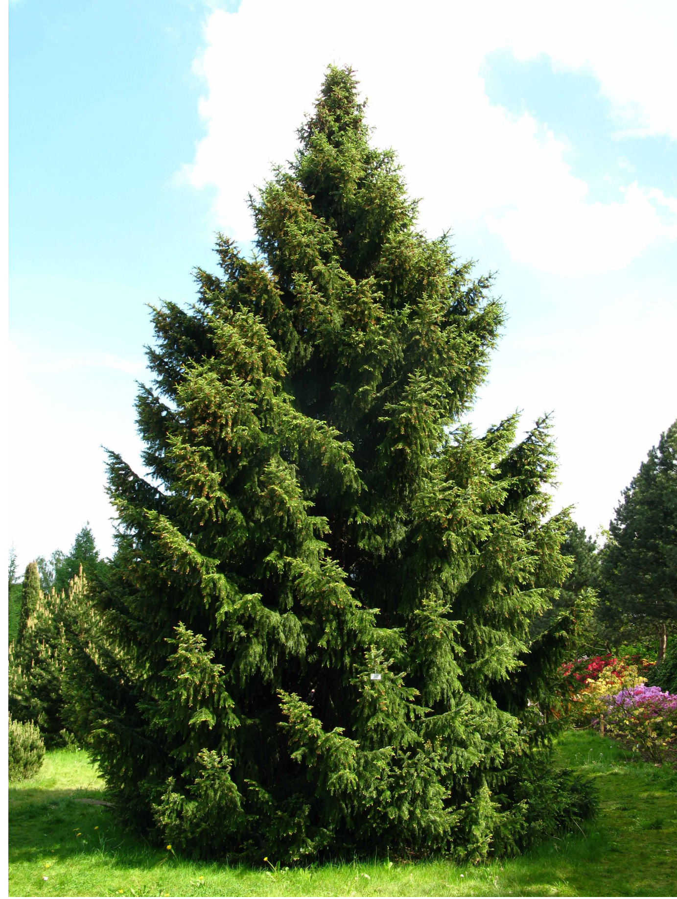
Serbian Spruce: Picea omorika