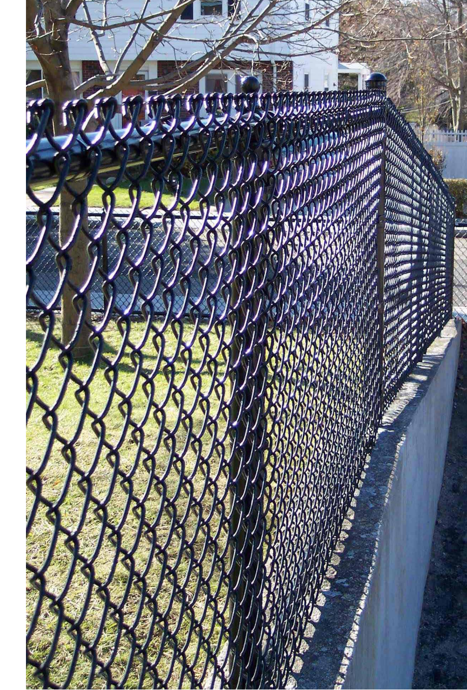
4' Black Ornamental Fencing