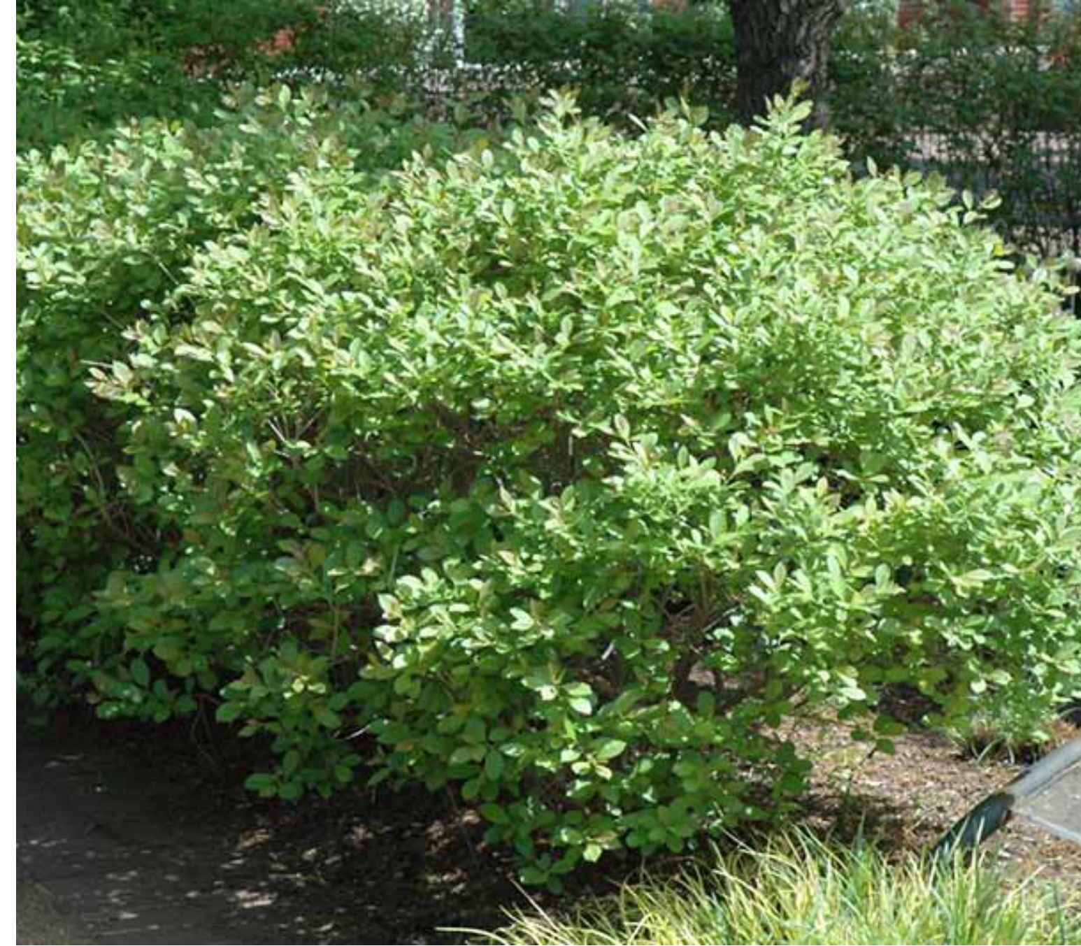
Red Sprite Winterberry Holly: Ilex verticillata 'Red Sprite'