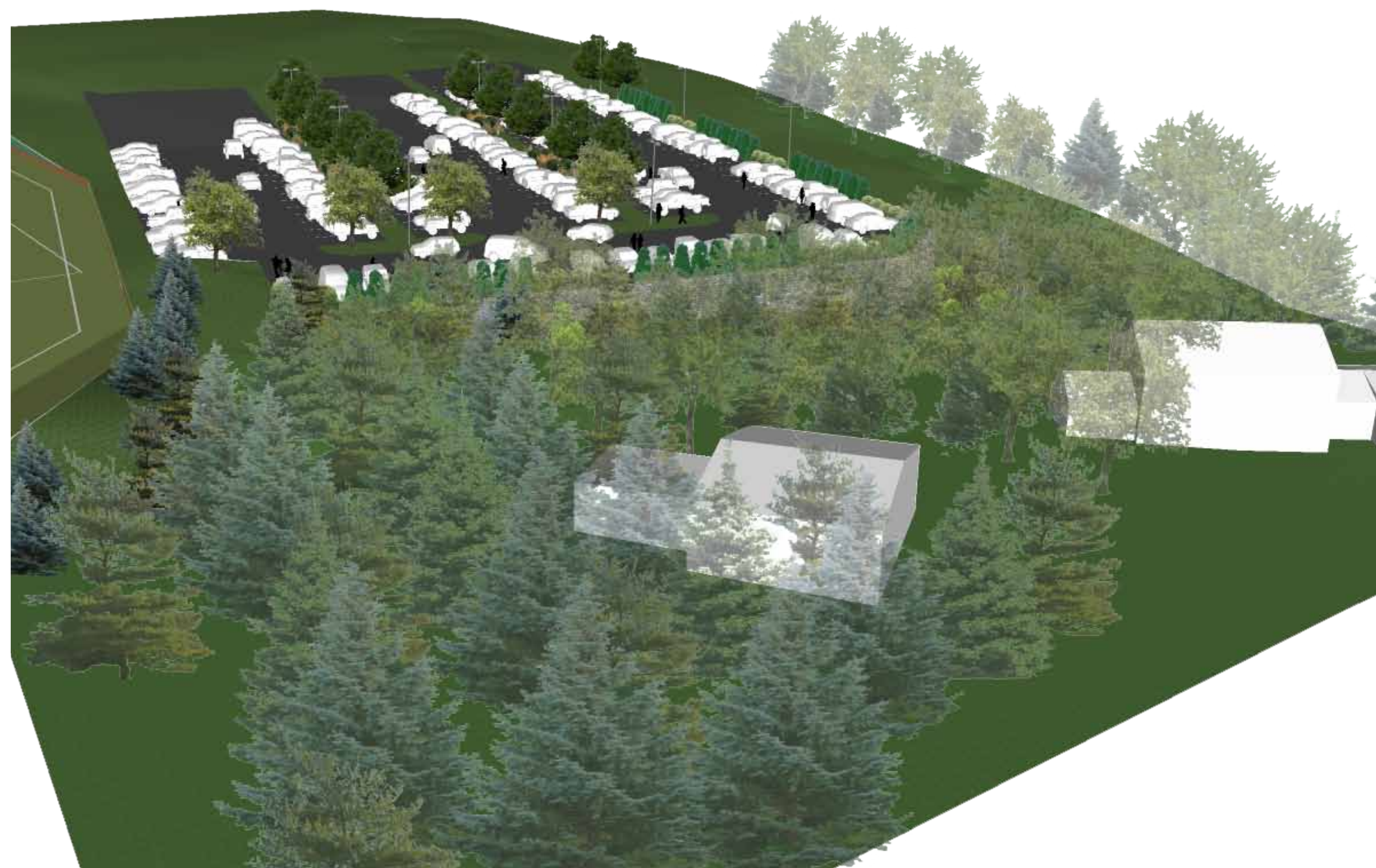
Proposed Buffer with Existing Conditions on Eastern Parcel Line