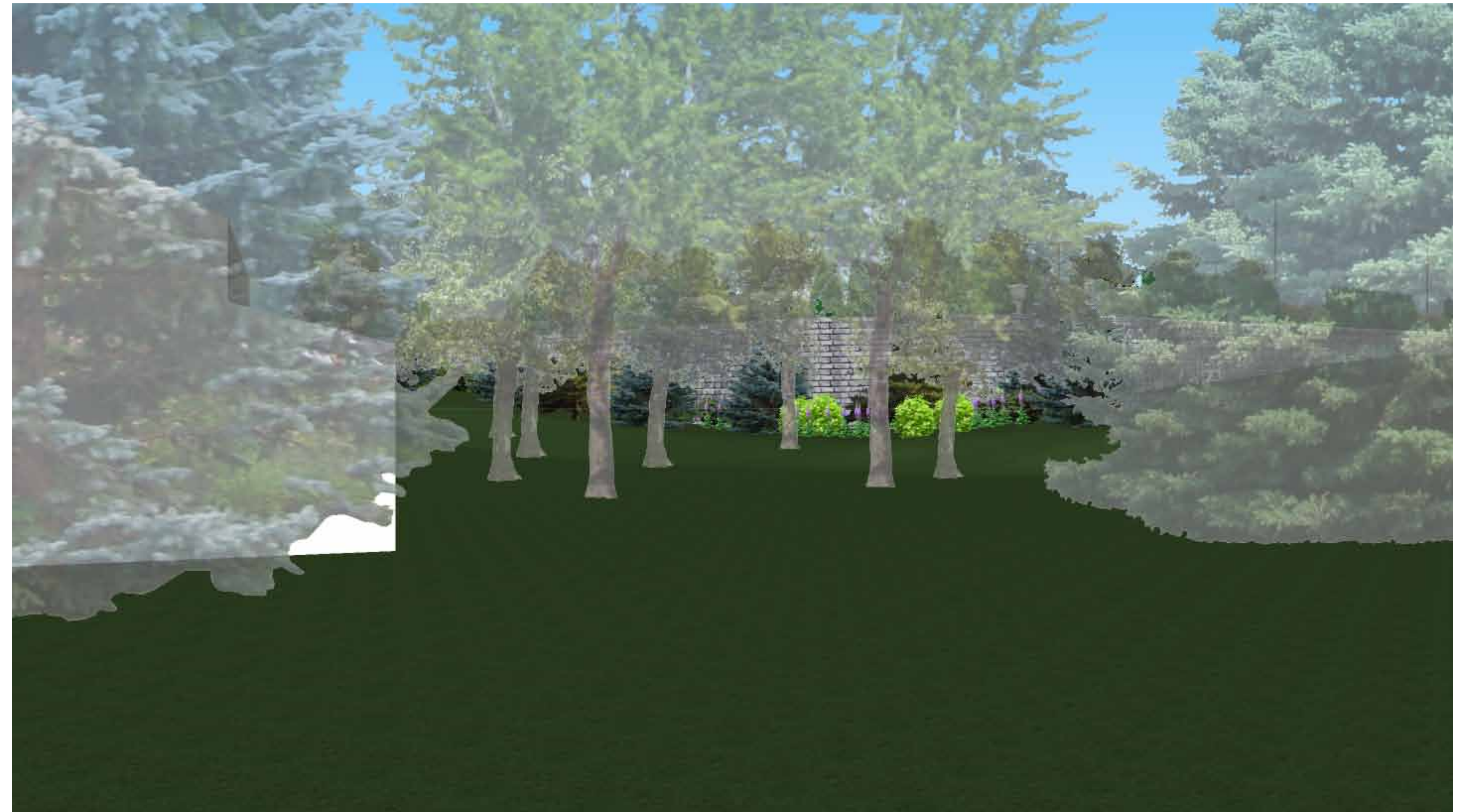
Existing View from Backyard of Northern Neighbor