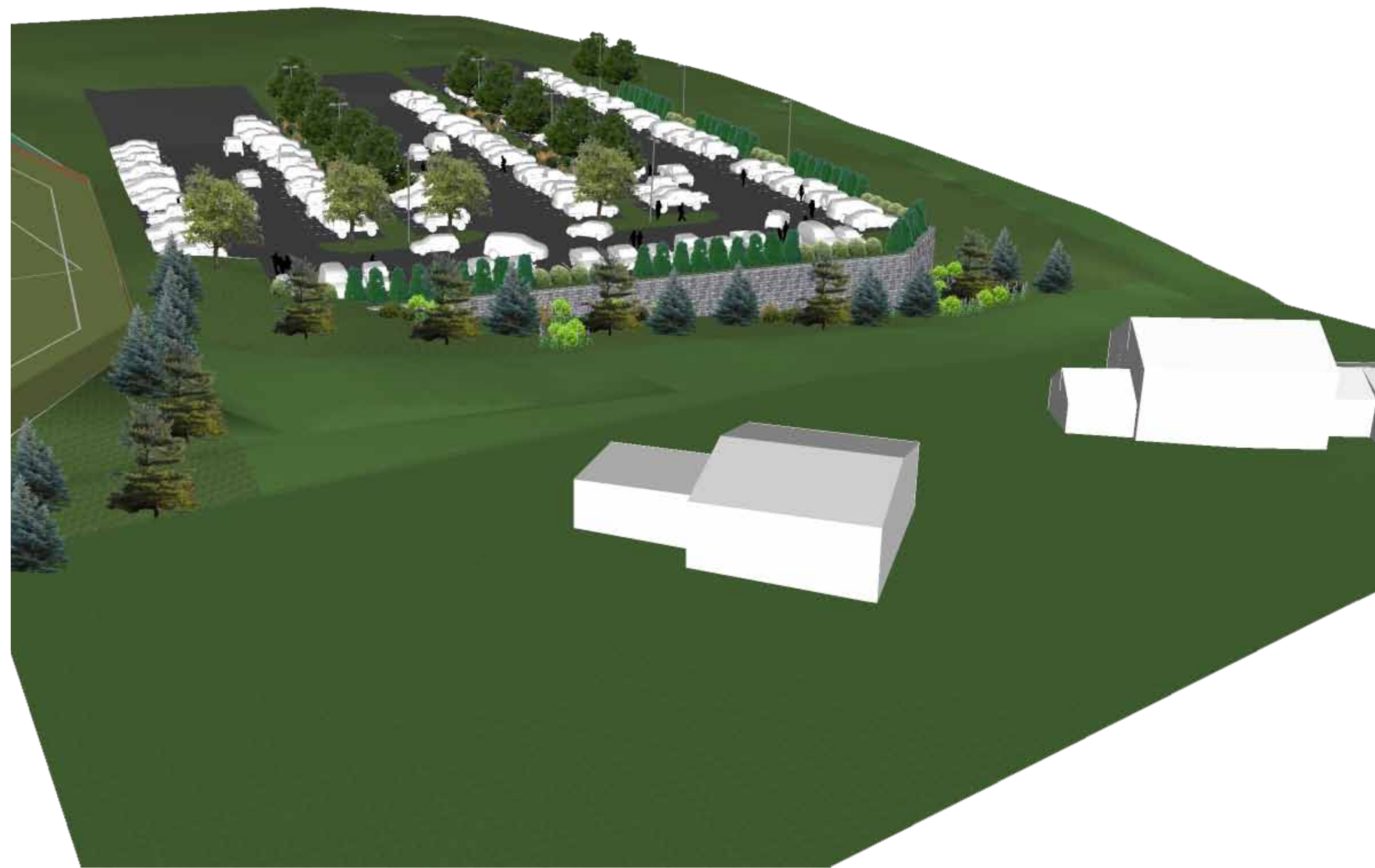
Proposed Buffer Plantings on Eastern Parcel Line