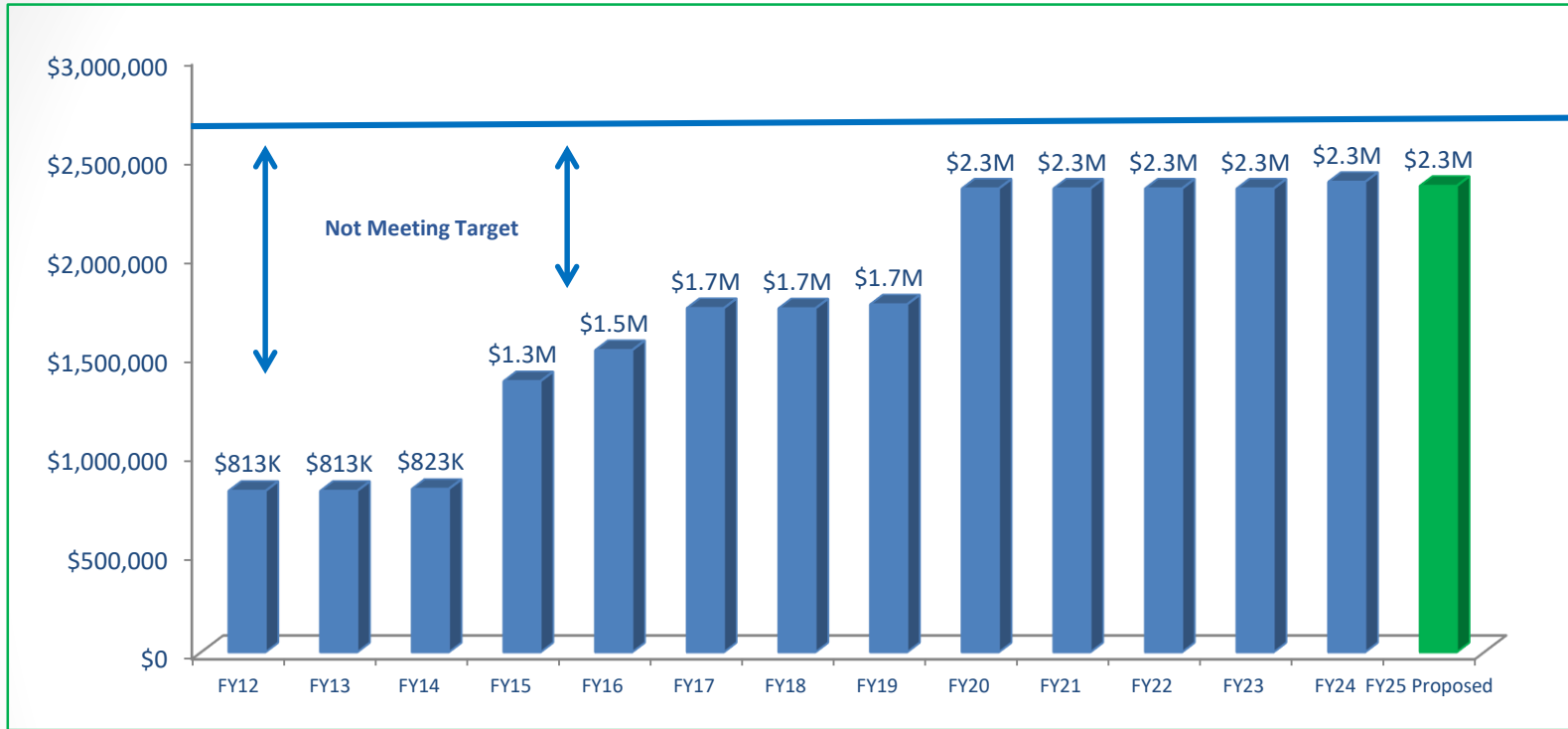
Base Capital for School and Municipal

Target Per Financial Policies Approx. $2.9M