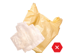
No Loose Plastic Bags, Recyclables in Plastic Bags, or Film Empty recyclables directly into your cart