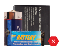
No Hazardous Waste or Batteries

© 2023 WM Intellectual Property Holdings, LLC. The Recycle Right recycling education program was developed based upon national best practices. Please consult your local municipality for their acceptable materials and additional details of local programs, which may differ slightly.