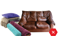
No Clothing, Furniture or Carpet