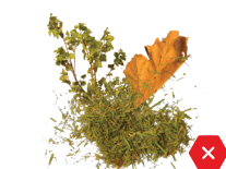
No Yard Waste