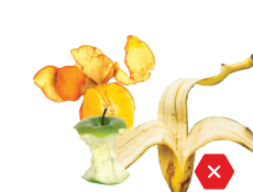
No Food or Liquids