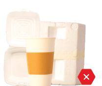
No Foam Cups & Containers