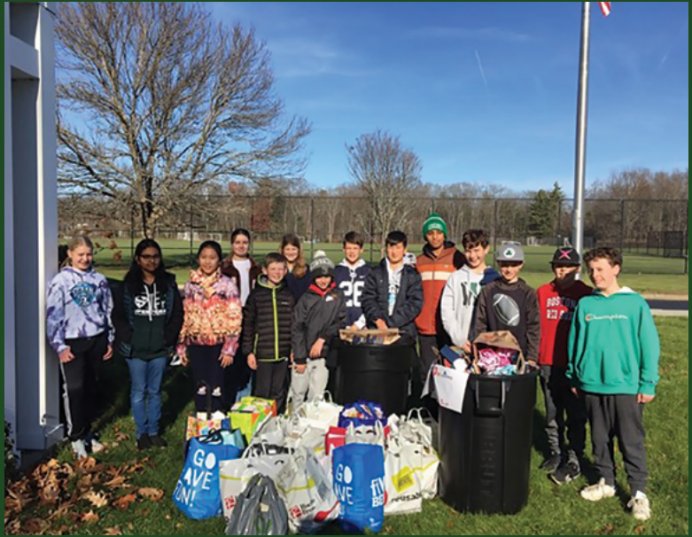
Top left: Integrated Preschool students singing holiday songs to seniors at the Center Bottom Left: Volunteers at the Center creating an herb garden for everyone to enjoy Right: Sixth Grade students delivering donated holiday gifts for homebound seniors