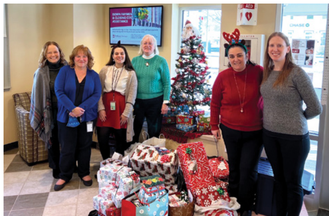
Dedham Savings Bank employees participated in the WY&FS Holiday Giving Program

WY&FS would like to thank the many Westwood residents along with the following businesses and organizations for their support of the program: Dedham Savings Bank, The Rotary Club of Westwood, Orange Theory