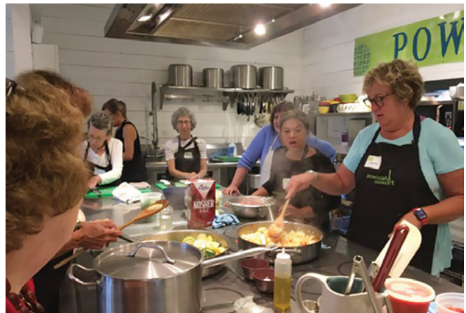
Cooking classes at Powisset Farm