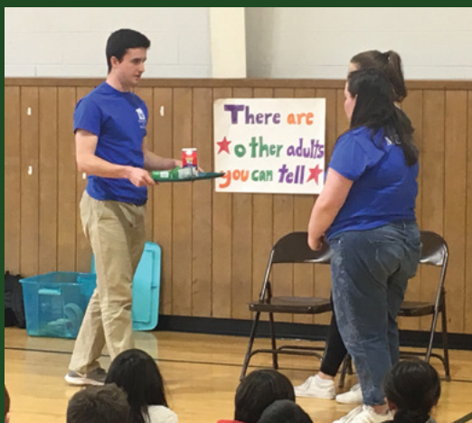
Students take part in Body Safety Theater in 2022.