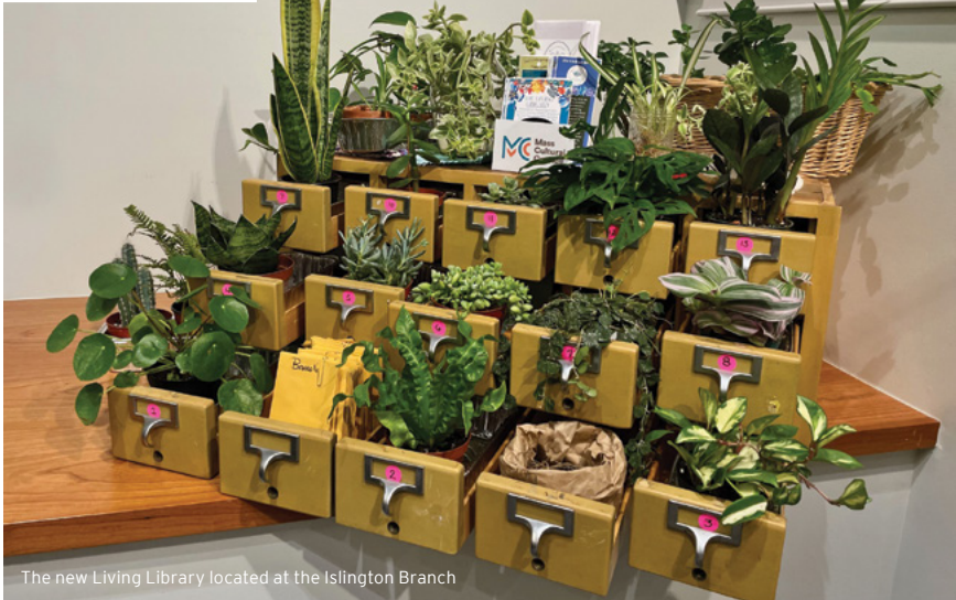
The new Living Library located at the Islington Branch

LIVING LIBRARY: Our series of Living Library plant programs (formerly "Bloom Zoom") brings you floral and gardening programs to encourage hands-on horticultural learning.