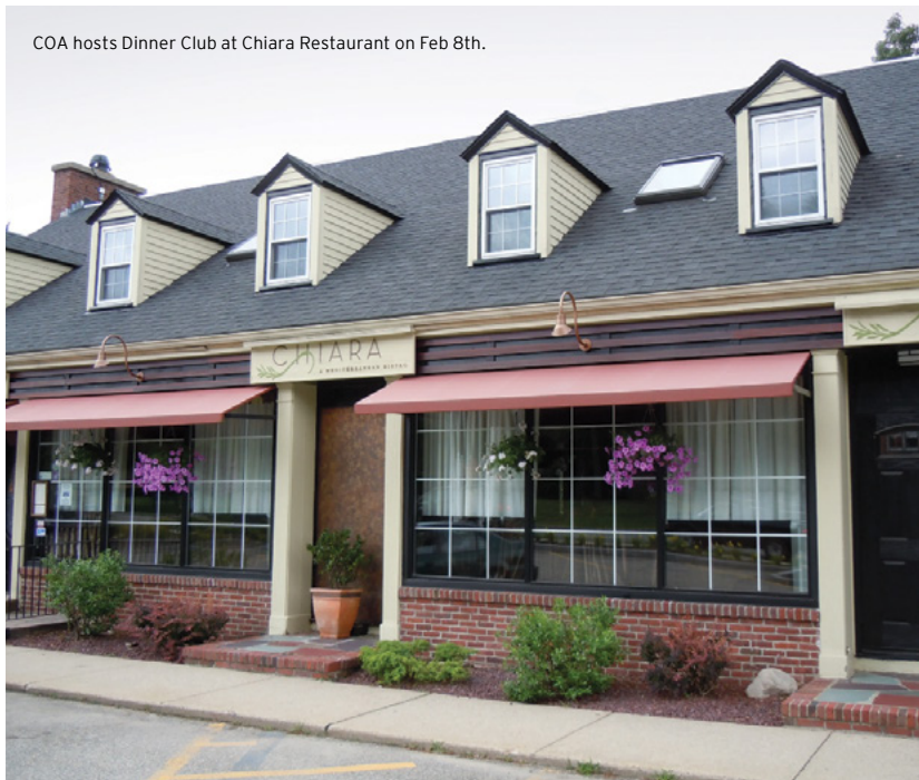
COA hosts Dinner Club at Chiara Restaurant on Feb 8th.

Wednesday February 8 at 5:00 p.m. Sign up begins on January 3. Dinner at Chiara, 569 High Street in Westwood Enjoy great food & make new friends! Payment must be made no later than February 1. $60 per person includes meal, tax and gratuity. The dinner will include: Soup (Roasted Tomato & Fennel Bisque with a Basil Drizzle), pan roasted free range