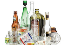
Glass Bottles & Containers