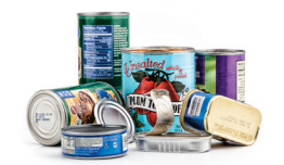
Food & Beverage Cans