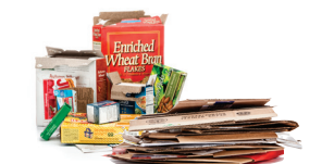
Flattened Cardboard & Paperboard