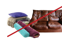
NO Clothing, Furniture & Carpet

To Learn More Visit: wm.com/recycleright