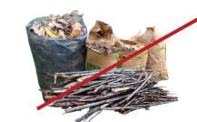
NO Green Waste