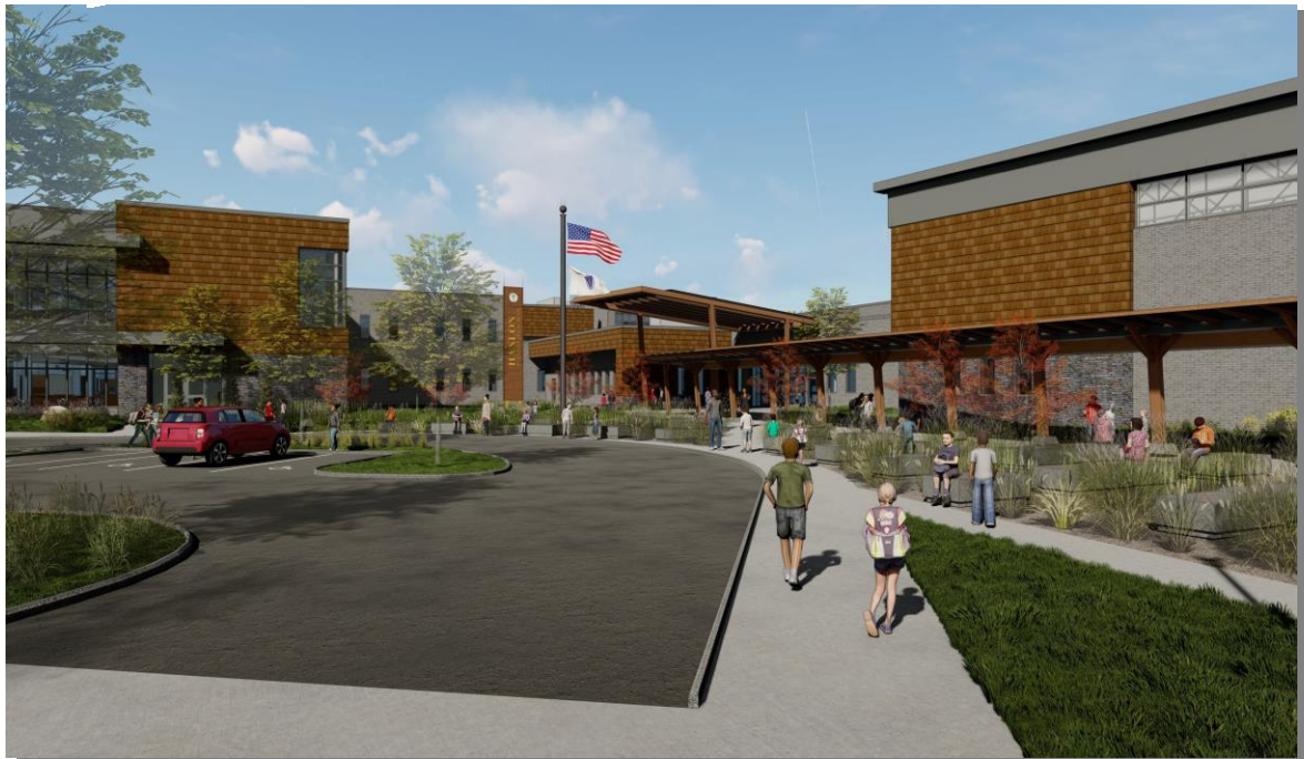
PROPOSED HANLON-DEERFIELD SCHOOL BUILDING