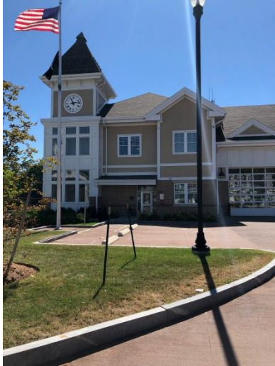
Islington Fire Station