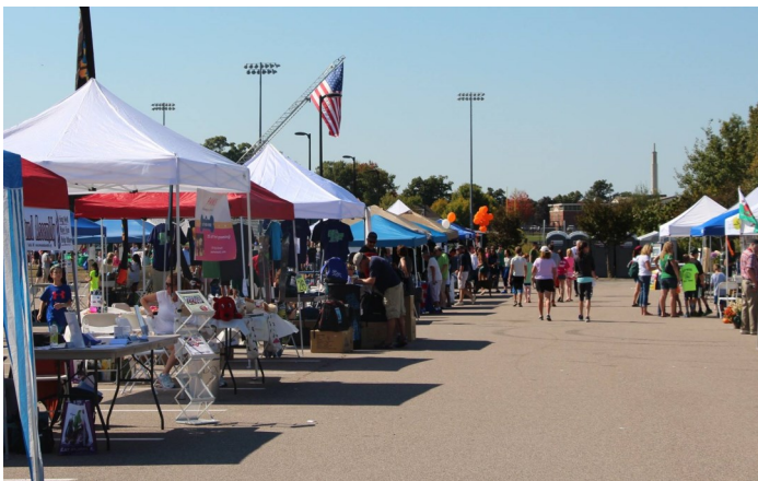
The expansive Vendor Village at Westwood Day.