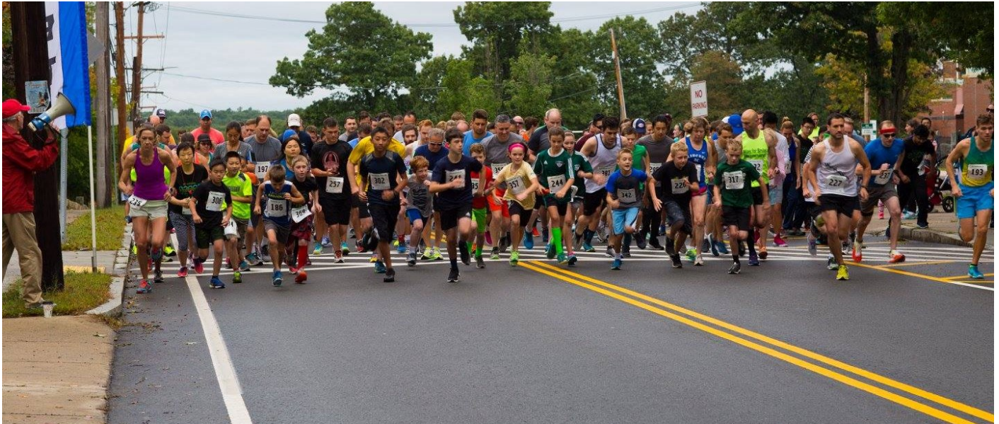
Runners take stride in the annual Westwood Day 5k!

The 8 th Annual Westwood Day will be held on September 21st, 2019! Westwood Day is a day long community celebration of all things that make Westwood such a wonderful place to live.