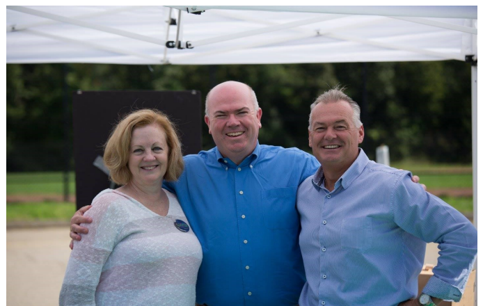
The Select Board members enjoying the atmosphere of Westwood Day.