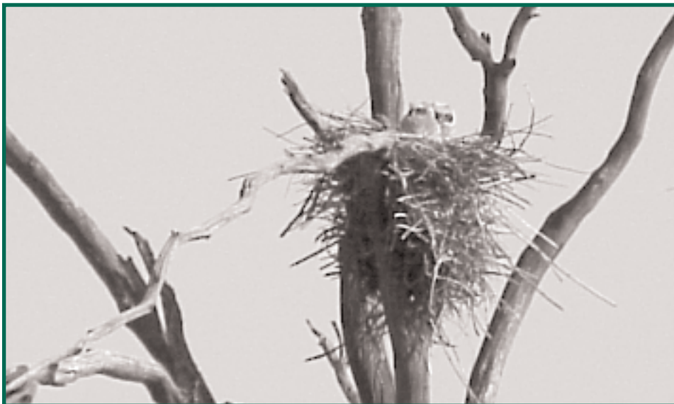
Two baby Great Horned Owls wait for their mother to arrive back home.

“This Land is Your Land” invited fellow residents to explore and visit the natural wonders of our town. That very same “invitation” is extended to you, our neighbors. We invite you to protect, conserve, enjoy, savor and love our natural unspoiled resources. Whether a first time visitor to these natural treasures or reacquainting yourself with an old friend, we hope that this guide will be useful.