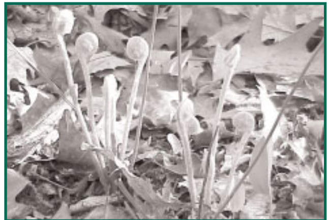
Spring brings back new growth to the woods.

Access to this area is from two Trailheads, behind the Hanlon School on Gay Street and at the end of the Sandy Valley Road extension. A trail map of the area is available online at www.townhall.westwood.ma.us .