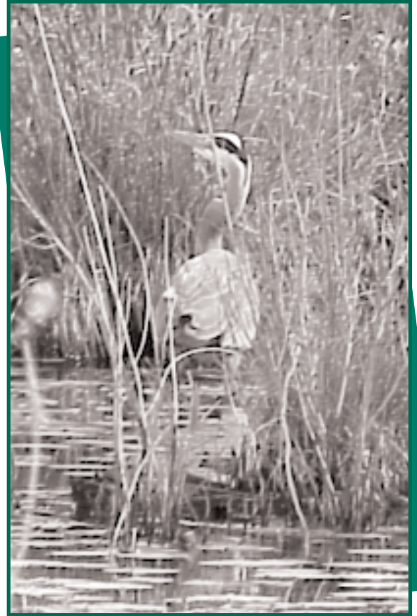
A Great Blue Heron looks for some lunch amid the tall grasses.

This 37 acre site is located in the southwestern section of Westwood. It was purchased by the Recreation Commission (precursor of the Conservation Commission) in the 50's with the school built on the site, leaving 28 acres that now house a baseball field, woods and wetlands including a pond. Several walking trails through wooded areas of deciduous and evergreen trees, with easy access to the pond, offer a wonderful environmental education site. Access is by way of the school, Tamarack Road or through the woods from Sunrise Road.