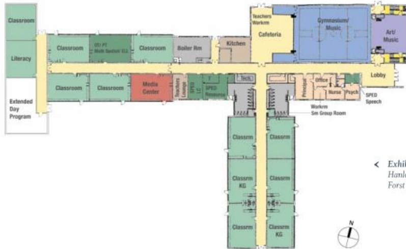
< Exhibit 2.8 Hanlon Elementary School First Floor Plan