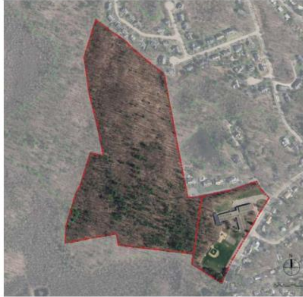
^ Exhibit 2.7 Hanlon Elementary School Site Plan

Section 2 Options Discussion | Elementary Schools