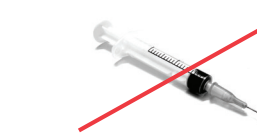
NO Needles (Keep medical waste out of recycling. Place in safe disposal containers like Waste Management's MedWaste Tracker@ box.)

To Learn More Visit: RecycleOftenRecycleRight.com #RORR