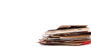
Flattened Cardboard & Paperboard