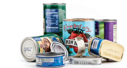
Food & Beverage Cans