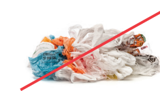
NO Plastic Bags & Film (Find a recycling site at plasticfilmrecycling.org )