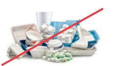
NO Foam Cups & Containers (Check Earth911.org for options.)