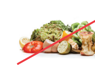
NO Food Waste (Compost instead!)