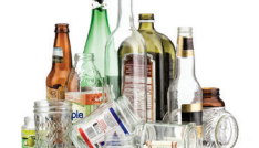
Glass Bottles & Containers