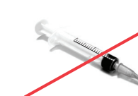
NO Needles (Keep medical waste out of recycling. Place in safe disposal containers like Waste Management's MedWaste Tracker® box.)

To Learn More Visit: RecycleOftenRecycleRight.com