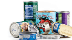
Food & Beverage Cans