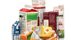
Food & Beverage Cartons