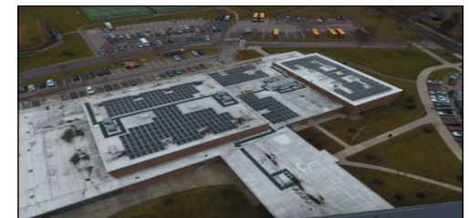
Westwood High School Solar Panels