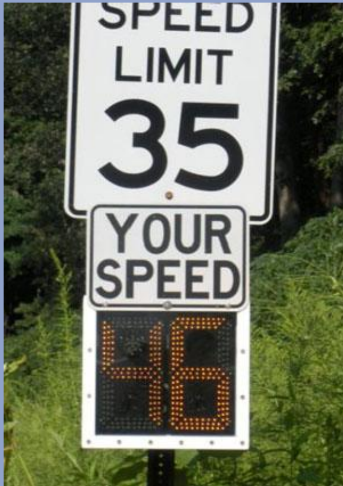
Example Dynamic Speed Display Sign