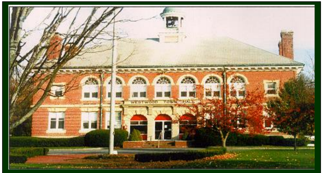
WESTWOOD TOWN HALL

SPECIAL TOWN MEETING NOVEMBER 17, 2014 – 7:30 P.M. HIGH SCHOOL AUDITORIUM