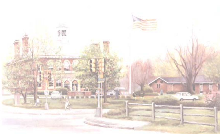
Westwood Town Hall

SPECIAL TOWN MEETING JUNE 19, 2007 – 7:30 P.M. HIGH SCHOOL GYMNASIUM