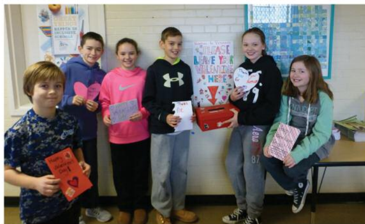
Hanlon fifth graders with their Valentine creations

Teachers jumped on board and orchestrated times for multiple grade levels to join together to create valentines for the project. For example, in one classroom, fifth graders worked with second graders to brainstorm and write their valentines together. In today's age of store-bought, candy filled valentines, it was quite a sight to see students