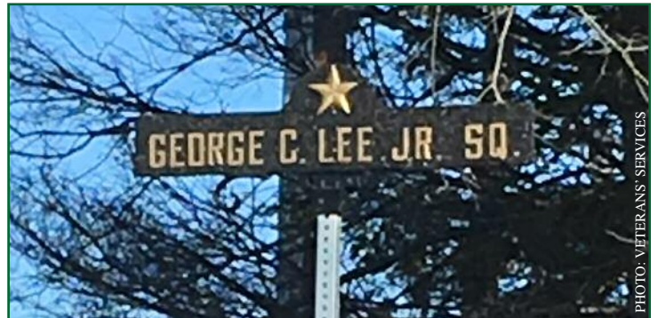
Signage around our Veterans' Squares are being refreshed over the next few months.

You may have noticed that several of the "Veteran's Square" plaques had been removed. They have now been replaced after being re-painted. The process of refurbishing the plaques will continue over the summer so if you are curious why some are missing, they are getting a much needed and over-due face lift.