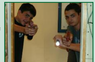
Two Westwood Explorers demonstrate proper procedure while "in training."