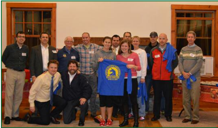
Hale Reservation will have several people with Westwood connections running in the 2014 Boston Marathon.

Hale Reservation is excited to be part of the Boston Marathon Charity Program once again this year. In 2013, Hale was selected among a very competitive pool of non-profit applicants looking to obtain the coveted invitational entries for the world's oldest continuous marathon.