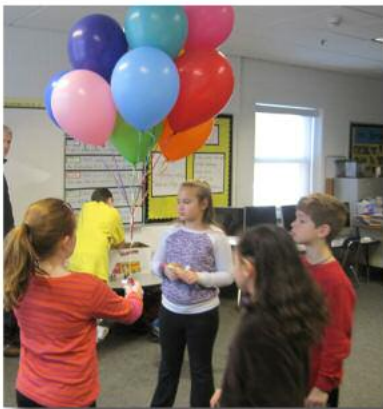
Students try to float their balloons for 30 seconds without them rising to the ceiling or dropping to the floor

Fourth grade students and parents at the Martha Jones Elementary School recently participated in an annual Design Day. The focus of the event was for students to learn more about the design and