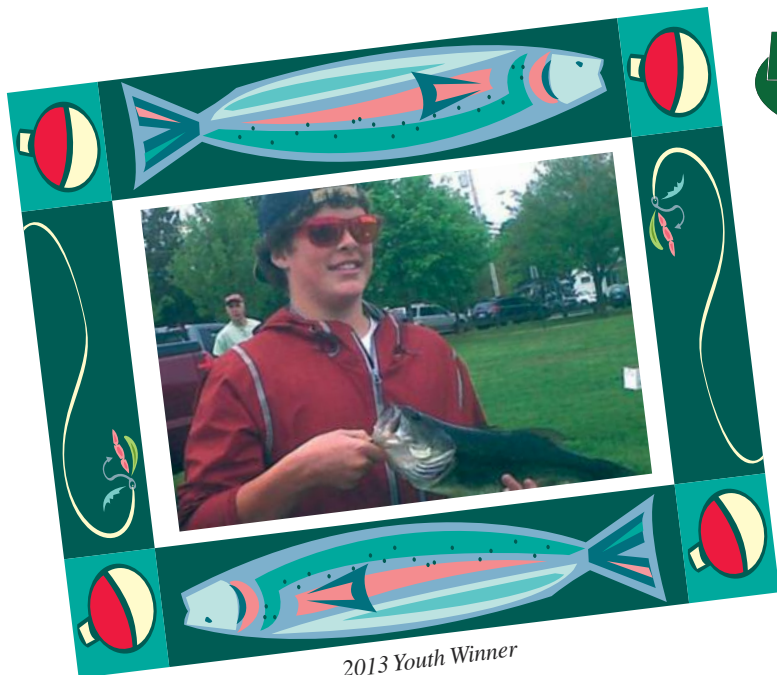
2013 Youth Winner

Sponsors North Walpole Fish and Game Westwood Permanent Firefighters Local 1994