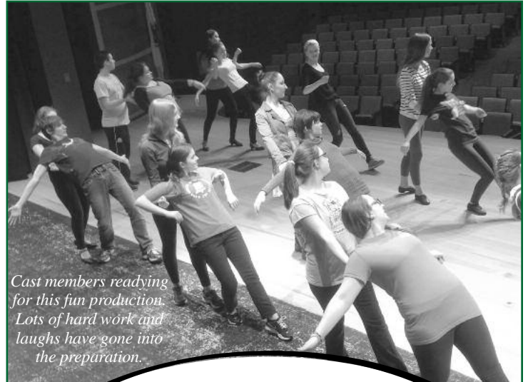
Cast members readying for this fun production. Lots of hard work and laughs have gone into the preparation.