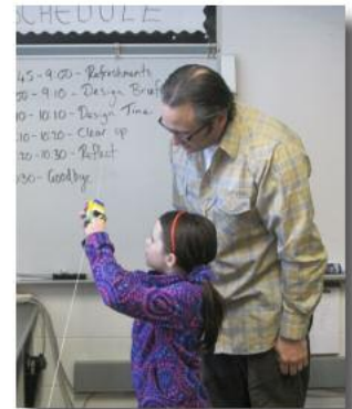
A student and her dad try out their zip line cart to see what adjustments need to be made

Challenge 5: Build a bridge that is at least 30 centimeters long and that will hold the weight of one Harry Potter book