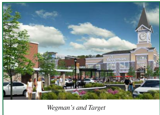
Wegman's and Target

At the time of the preparation of this update, the Norfolk County Commissioners had conducted one of two public hearings to consider the proposed traffic calming measures on Everett and Canton Streets, which are county roadways. If this proceeds as projected, the County Commissioners will issue its approval for these traffic calming measures and the Town will begin testing each of the proposed measures before beginning construction in the summer.