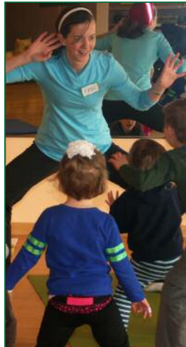
Fun and active program for Little Yogis

Are you looking for a good "stretch" with your 3-7 year old on a Saturday morning? Little Yogis is a fun, active program for