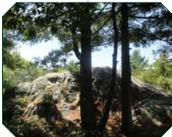
A craggy boulder is just a hint of what awaits visitors to Sen Ki

enjoy the land. While Hale will maintain the property, the Westwood Land Trust will oversee the conservation restriction.