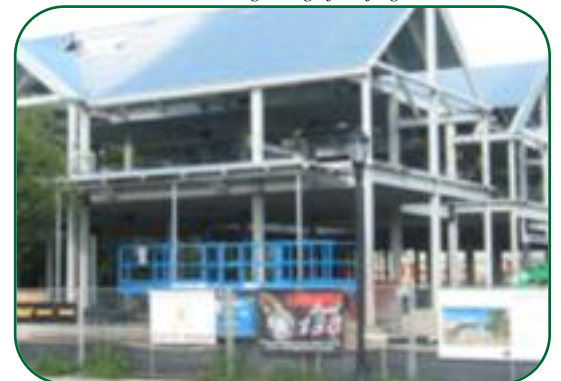
Library construction continues smoothly. This photo shows steel outlining the shape of the new building and the beginning of roofing.

We will be accepting monetary donations for the Westwood Food Pantry and we are looking forward to seeing you and your family at the clinic on October 15th. If you have any questions, please contact the Health Department at 781.320.1026.