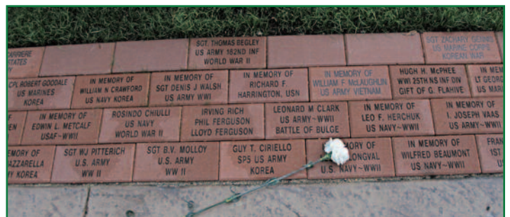
Veteran’s Day ceremonies were held on November 11, 2010 at Veteran’s Park. Pictured here is a detail of the memorial bricks along the walkways in the park.

Dedham Savings invites you to join us in celebrating our 27th Annual Holiday Program. Please consider visiting our Main Office, 55 Elm Street in Dedham during the week of December 13th to the 18th for live holiday music (local choirs, schools, soloists, etc), hot apple cider and light refreshments. Each branch, including the Westwood Office, will also be celebrating by providing hot drinks and refreshments during this week. Our complete performer schedule will be available in all branch locations at the beginning of December. Some of our Westwood favorites have already informed us that they are coming, so please mark your calendars. The Westwood Swing Band will be performing on Thursday, December 16th from 12:00 pm to 1:00 pm and the First Baptist Church of Westwood Bell Ringers will join us on Saturday, December 18th from 10:30 am to 12:00 pm. We hope to see you. Happy Holidays! ❖